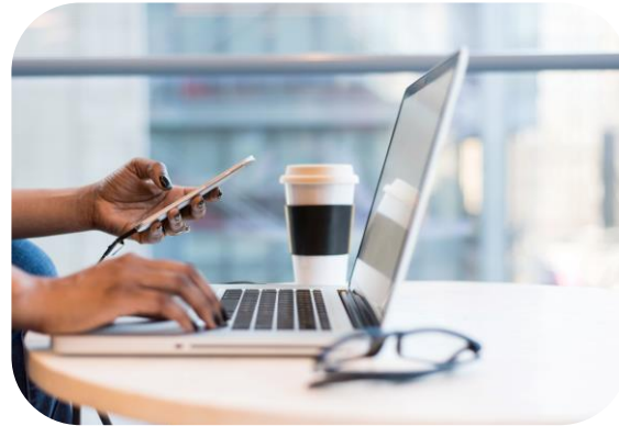
Online Application Process