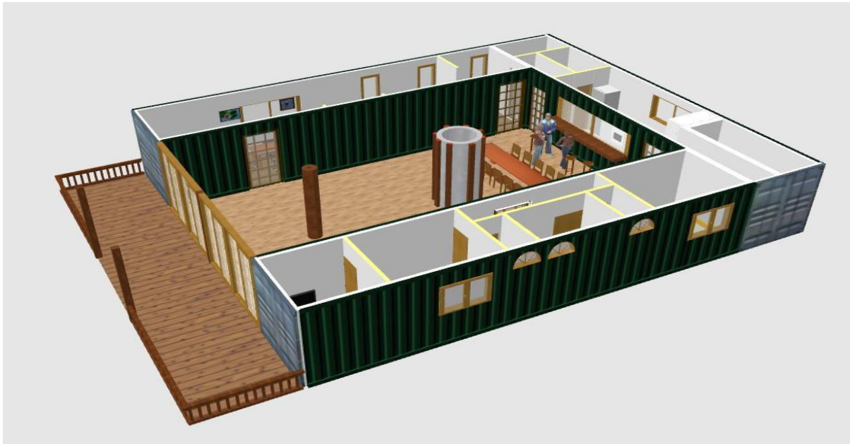
Schematic of STEAM Centre showing the proposed layout without the roof